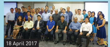
18 April 2017