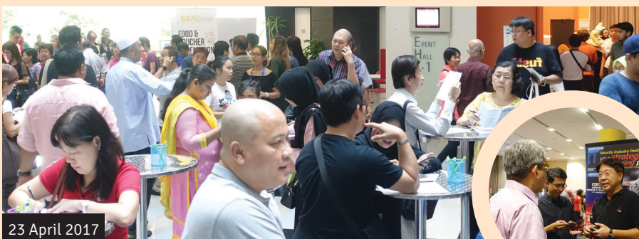
23 April 2017