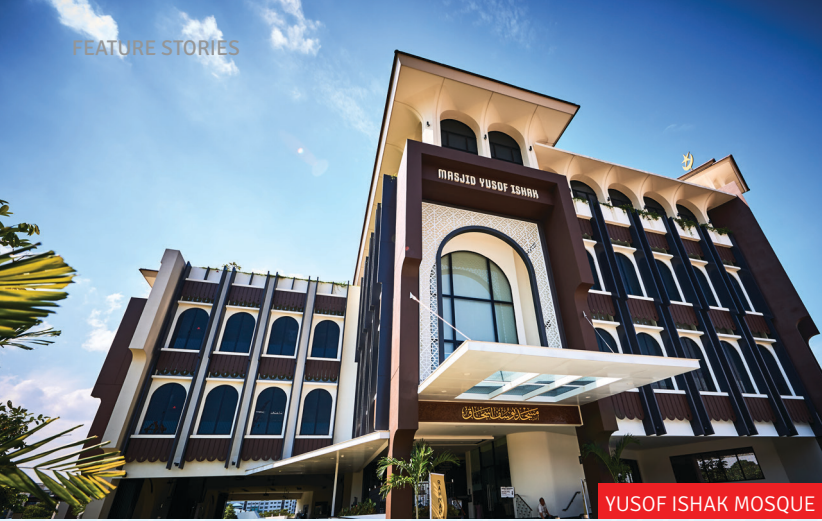
YUSOF ISHAK MOSQUE