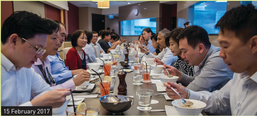
15 February 2017