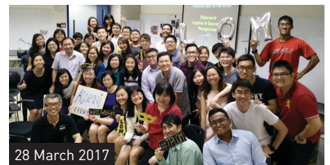
28 March 2017

Temasek Polytechnic's Logistics and Operations Management (LOM) Reunion 2017 was not just a reunion event about past achievements and events, it was about being future ready too! This year, the 32 alumni who congregated at SII had greatly benefited from SII's sharing on SkillsFuture initiatives and courses that would address security issues relevant to the logistics industry. They were encouraged to constantly upgrade themselves to remain relevant in the industry. Most importantly, the attendees also had a whale of a time reminiscing and catching up with old-time friends, classmates and lecturers.