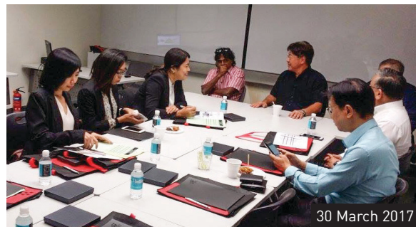
30 March 2017