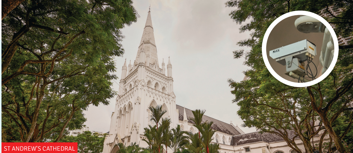
ST ANDREW'S CATHEDRAL