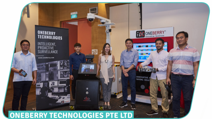
ONEBERRY TECHNOLOGIES PTE LTD

Award-winning security solutions provider, Concorde Security, has an exciting addition to its acclaimed I-Guarding™ Solution—a flying drone that compliments the family of the I-Guarding™ Solution to broaden the area of surveillance. So, instead of having the I-Man (security professionals manning the mobile command and control centre) to survey a given area, he will be stationed in the vehicle and use the drone to survey the place.