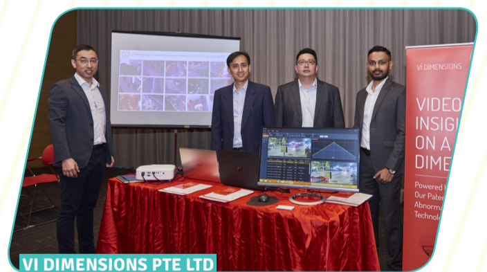
VI DIMENSIONS PTE LTD

Gabkotech’s flagship product, iREP Security, is a smartphone application that helps security officers to step up security level and communication with the command centre. Launched in November 2012, the iREP Security allowed for quick response time and real-time reporting. The company has since deployed over 92 agencies in Singapore with about 6,000 users to date.