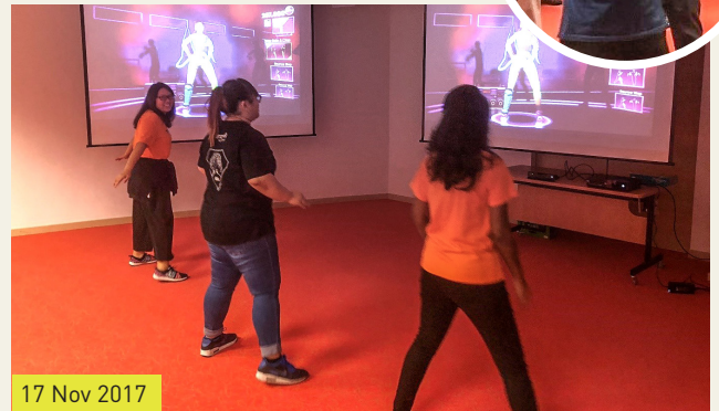
17 Nov 2017