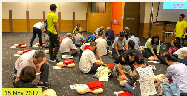
15 Nov 2017

SII organised a lunch time hands-on training with the Lifelong Learning Institute on “Cardiopulmonary Resuscitation (CPR) and Automated External Defibrillator (AED)” for SII Alumni and members of the public in support of the Lifelong Learning Festival 2017. 26 participants learned to dial 995, stay on the line with the medical dispatcher, perform CPR as directed and use an AED with voice prompts.