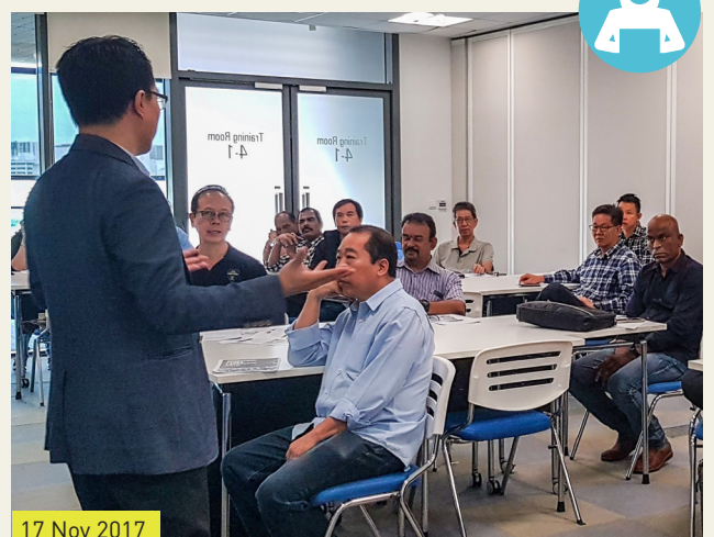
17 Nov 2017