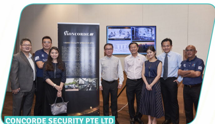
CONCORDE SECURITY PTE LTD

The emergence of new technologies coupled with the $10M Government funding for the initiatives under the security ITM encourage companies to further innovate, improve existing security solutions and develop new ones. Here are four industry forerunners who are riding on this new wave of change.