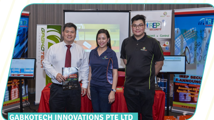
GABKOTECH INNOVATIONS PTE LTD

This year, it has begun working on security robot known as “Oneberry RoboGuard™”. This customisable RoboGuard runs on an independent power source to complement security officers.