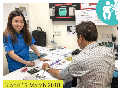
5 and 19 March 2018